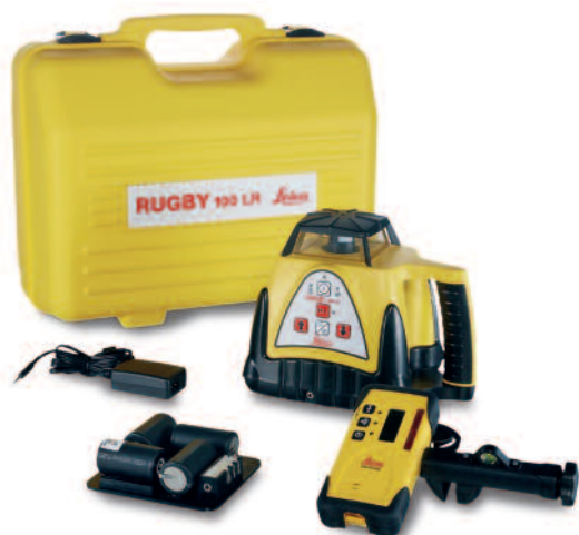
Recommended package consists of laser, carrying case, ROD-EYE Pro sensor and optional NiMH charger and battery pack